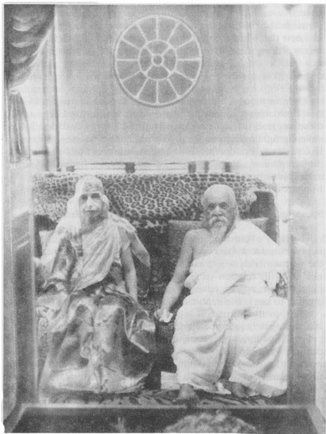
Sri Aurobindo and The Mother ( Darshan ) (1950)