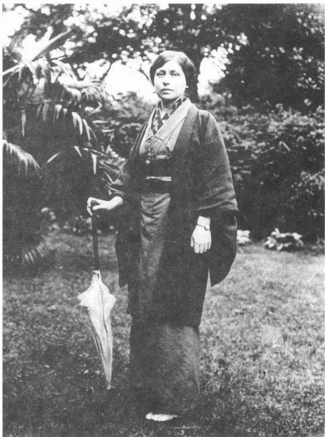
The Mother in Japan