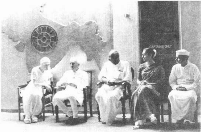
The Mother with Jawaharlal Nehru, Kamaraj, Indira Gandhi and Lal Bahadur Shastri at the playground of the Sri Aurobindo Ashram, Pondicherry